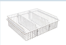
Optional Quick Slide Basket

Subject to modification. For up-to-date information, visit home.liebherr.com